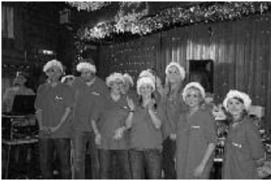
Co-op staff at Xmas Party