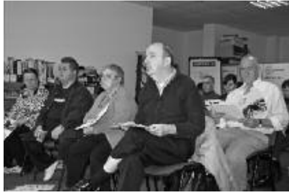
Annual General Meeting