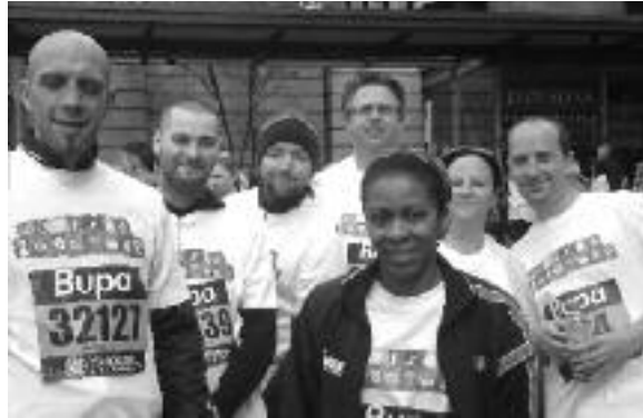
Fund raising run