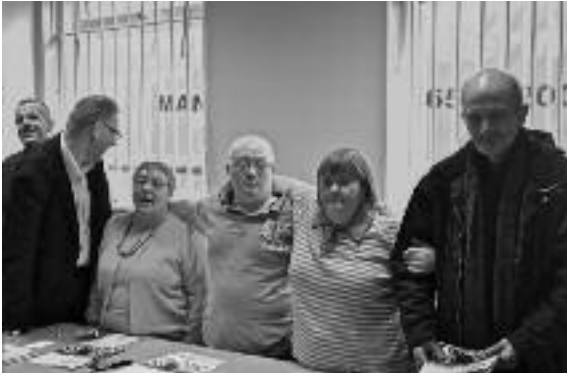
Directors and committee